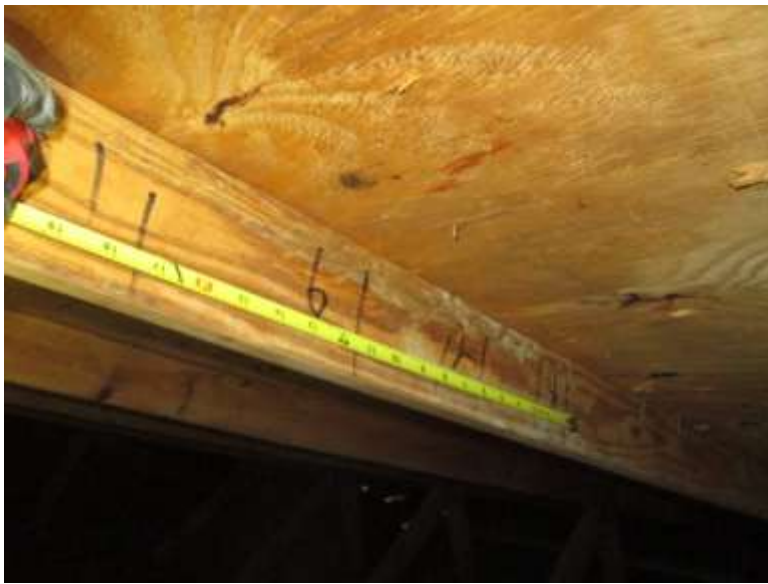
Nails spaced every 6 inches