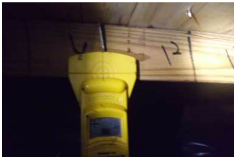
Nails spaced every 6 inches