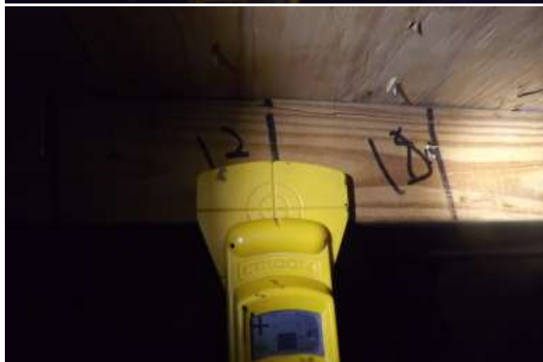
Nails spaced every 6 inches