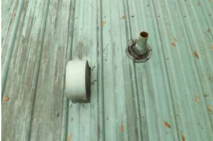
Waste vent Cast Iron