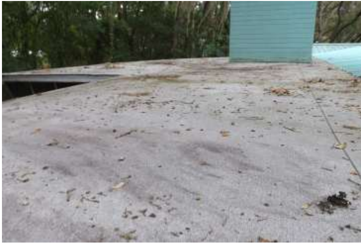
Flat roof Roof Adhered Modified Membrane