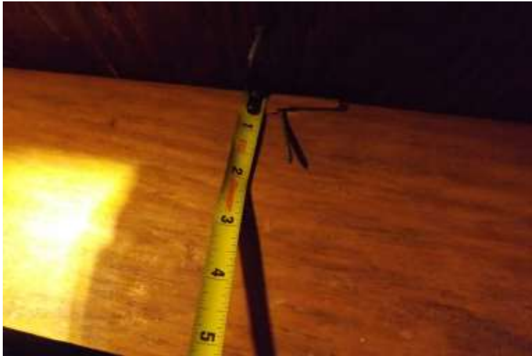
Truss #8d nail