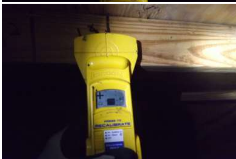
Nails spaced every 6 inches