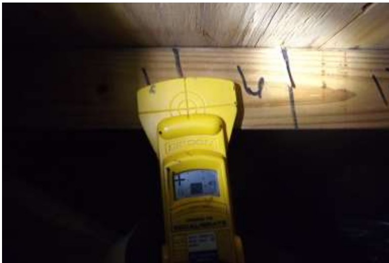
Nails spaced every 6 inches